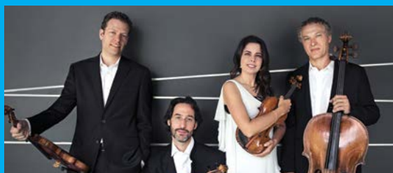
Pacifica String Quartet